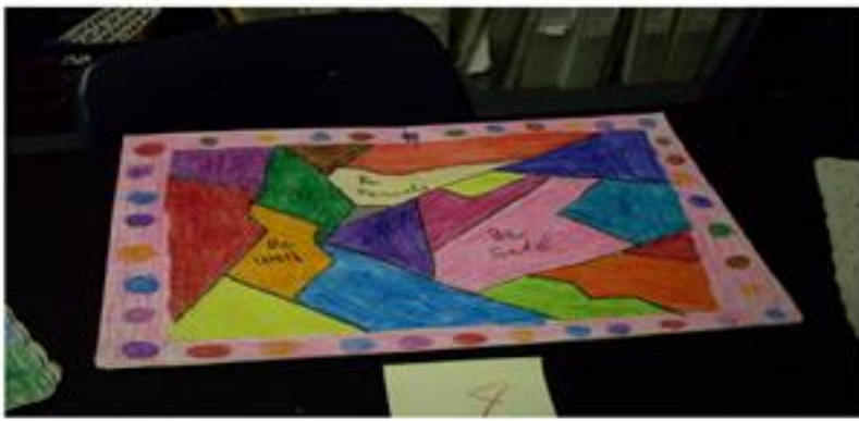
Notre Dame elementary art students bring great Hope & Joy to people at the: Annual Kairos Retreat @ Sumter Correctional Institute October 13-16

Starfish strategies: meaningful/reflection/choices and emotions Using symbols of the church and incorporating borders and patterns to the bright colorful placemats, students used crayon as their media and really encouraged and helped many sad and lonely people feel better because God gives wellness, peace, strength, safety, and calm to us all.